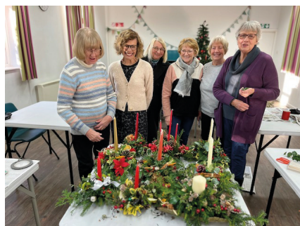
Making Christmas Table Centres Tutor & photo – Jeanne Threlkeld