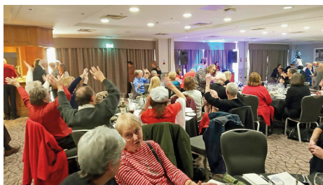
Mamma Mia Christmas Party Lunch at the Hilton, Cobham.