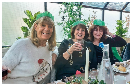
Christmas Lunch at The Gallery.